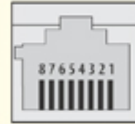
RJ45 KEYED 8x8