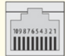
10 POSITION 10x10