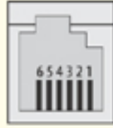
MMJ OFFSET 6x6